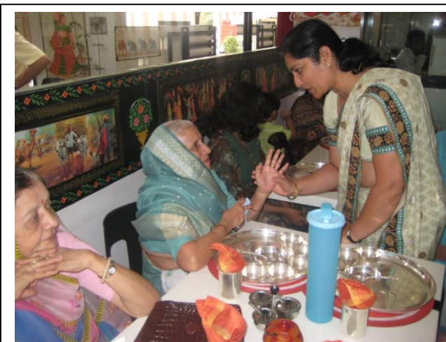
Diwali being wished by one of her nieces. Pune 2009

In 2010, on her 81 st birthday, I compiled and gave her a Photobook. This book included pictures with her parents when she was young, and as the years went by at various milestone events and with her children, grandchildren and great-grand children. ❖