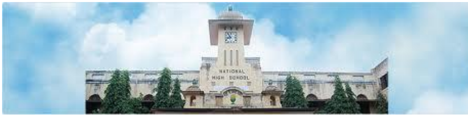
National High School

The first stop was at Vani Vilas Road, near my school, National High School Circle where a few people working in South Parade or Brigade Road got in. It was still early for students to assemble for their morning prayers – yum brhama varunendra rudra maruthaha , an invocation to the Gods.