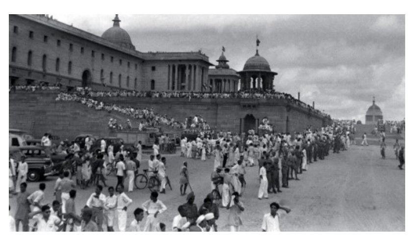
Crowd with South Block behind it, before it became large. The writer and his family are a part of this crowd.

But, within minutes, amidst thunderous applause, some dhoti-clad men climbed up the minarets, pulled down the British flag, and replaced it by the national flag.