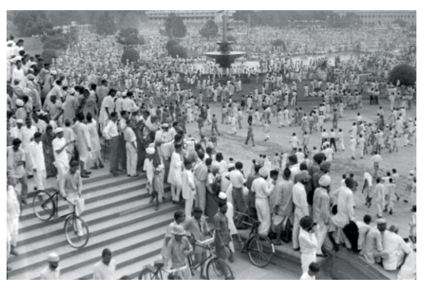
Crowd on the steps leading to Raisina Hill overlooking Great Place, which is Vijay Chowk now.