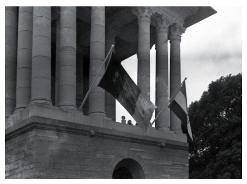
The Indian Army's Standard and new India's national flag flying side by side from the colonnades of the Army Headquarters in South Block on the morning of 15 August 1947. The Indian flag had replaced the British Union Jack there a short while earlier.