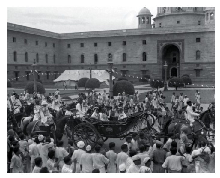
This is the same ceremonial Mountbatten carriage at a point between South Block (to the right) and North Block.